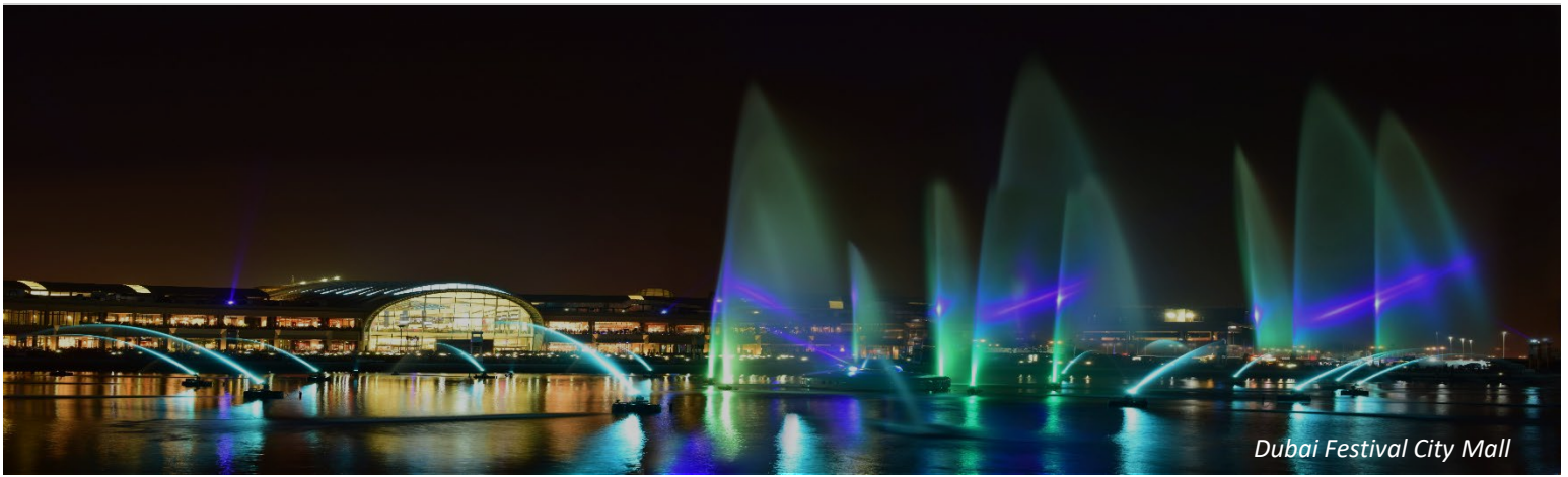
Dubai Festival City Mall